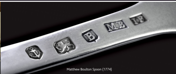
Matthew Boulton Spoon (1774)