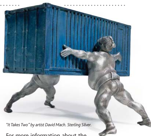
"It Takes Two" by artist David Mach. Sterling Silver.

Pangolin London, an impressive new gallery at Kings Place will open in October 2008. It will house a changing programme of exhibitions showing the best of contemporary sculpture in silver, bronze and other materials and aims to showcase up and coming artists alongside established international names.