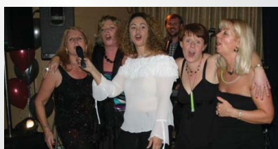
Birmingham Assay Office Girls Partying hard at last year's ball

The Jewellery and Giftware Ball, in aid of the British Jewellery Giftware and Finishing Federation Benevolent Society, is set to take place on Thursday 20th November at The Birmingham Botanical Gardens.