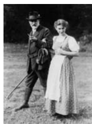
Sigmund Freud with walking stick